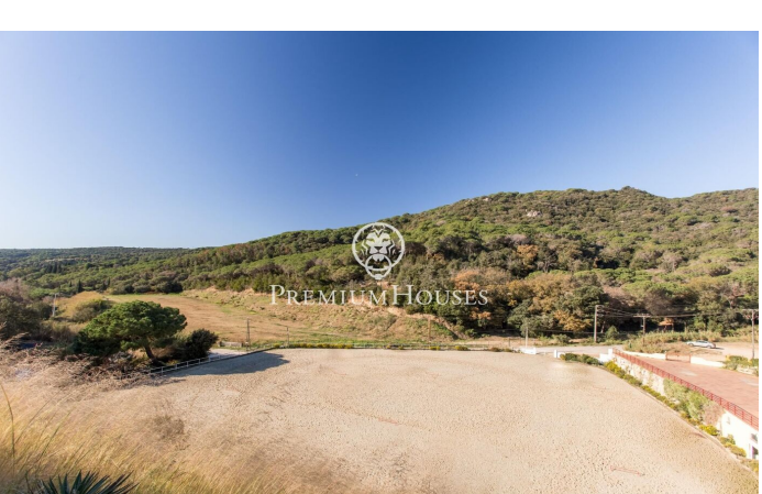
Barcelona Coast, the best place to live Over 2,500 hours of sun per year