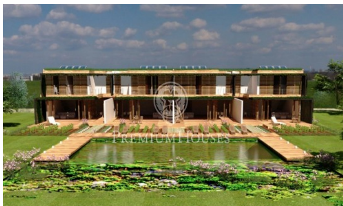
CASA TIPO 1