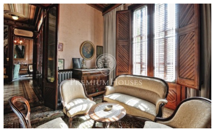
Contact us for more information or to arrange a viewing