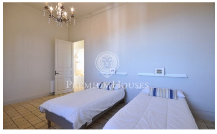
Contact us for more information or to arrange a viewing