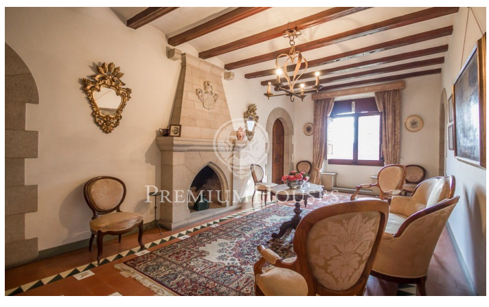
Contact us for more information or to arrange a viewing