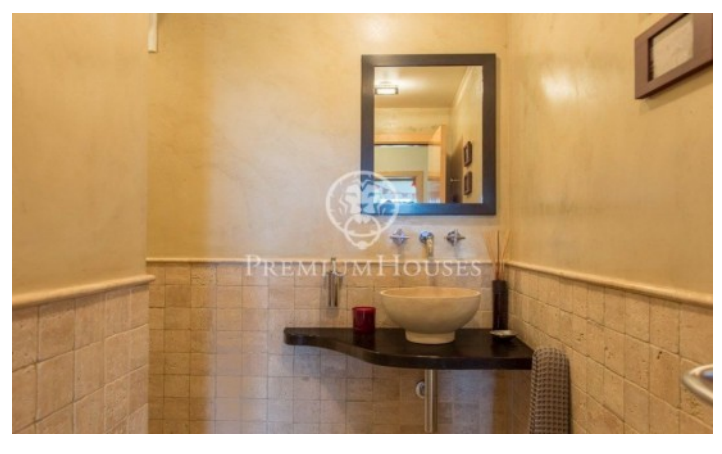
Contact us for more information or to arrange a viewing