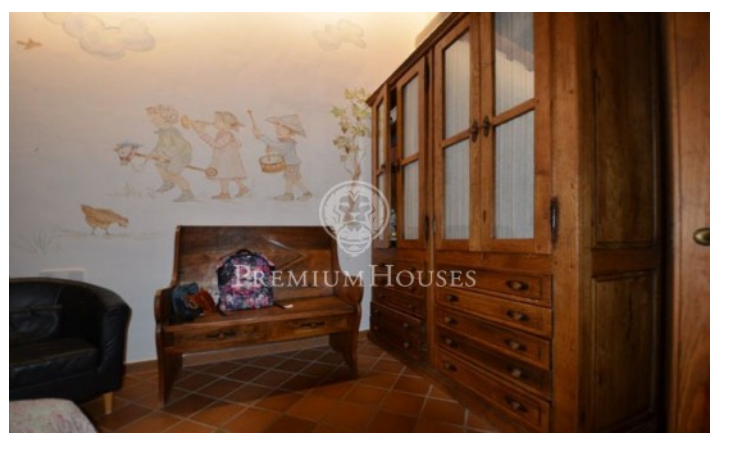
Contact us for more information or to arrange a viewing